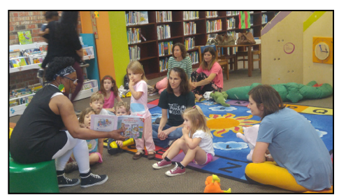
Preschool Storyhour is both fun and educational!

Parents are reminded that they must accompany and remain with their children during each Storyhour program.