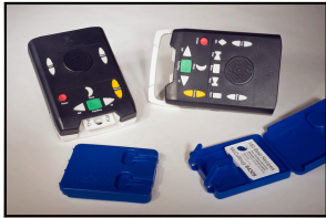
Picture of talking book digital cartridges and digital player machines

The Talking Books Service is provided by the Mississippi Library Commission (MLC) for eligible MS residents who are unable to read standard print, whether it is from a visual, physical, or organic reading disability (such as dyslexia).