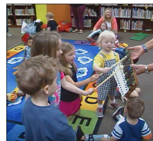
May 6th was Alphabet "X" & "Y" Story Hour and the kids enjoyed playing the xylophone.