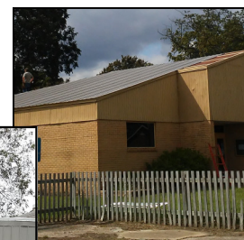
Rosedale Public Library, above, with the new roof being installed, and left, after being painted.