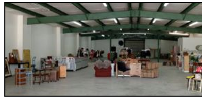
Consign for a Cause is next to South Street Pharmacy.

goods – they do NOT take clothing or shoes, however. If you have an item and you’re not sure if they will accept it, please call them at (662) 902-0590.